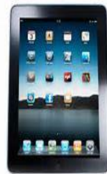
Sample iPad Issued to PLDRB Members