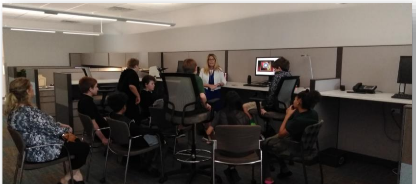
Career Day for Bunnell 6 th Graders

Monday kicked off a new C.H.I.R.P. program called City Career Day where City Hall staff hosted 56 Bunnell Elementary sixth graders. The students rotated through several departments where chosen fields were preselected to feature the array of City positions that might one day be available to them. The event was well received by students and City staff alike. Everyone enjoyed the opportunity to collaborate with each other, as it was all hands on deck to make the students experience informative and yet, fun at the same time.