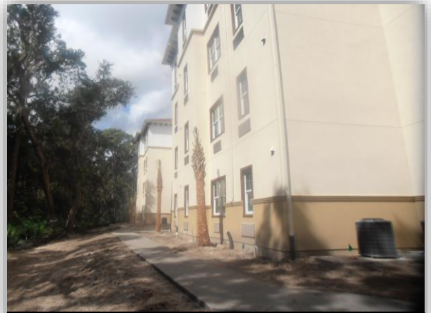
Tuscan Gardens Assisted Living Facility

The first Phase of Tuscan Gardens Care Facilities is nearing completion. This site is located at 650 Colbert Lane. The contractor is currently placing landscaping plants in the court yard and alongside of the buildings.