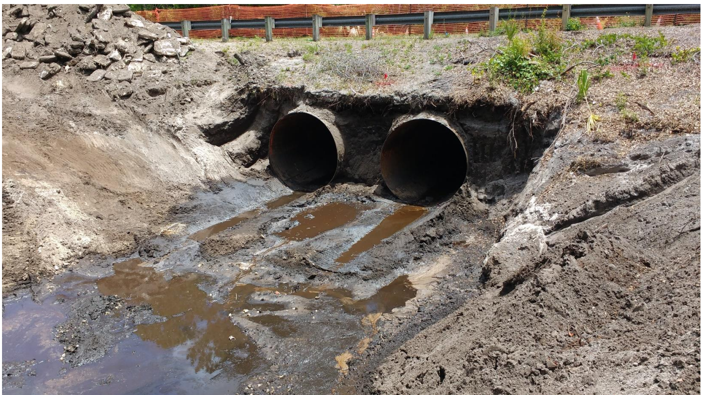
Pine Lakes Pedestrian Bridge