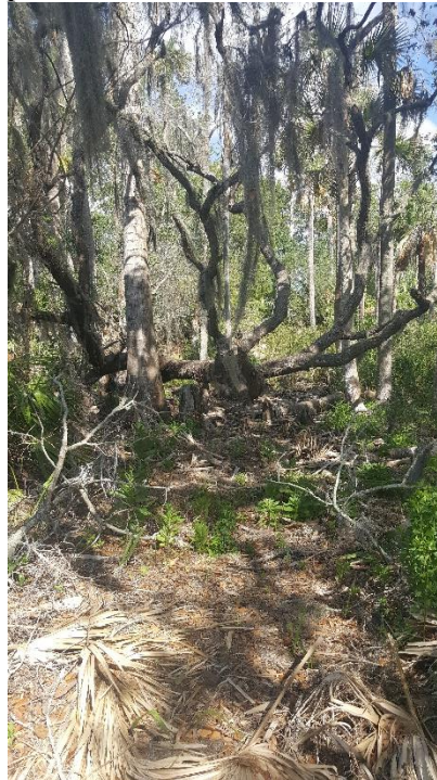
Figure 1: Photo Station in Long Creek Nature Preserve

This past week, the new Recreation II of Nature Programming assisted in a tour of Long Creek Nature Preserve as well as assisting in the annual monitoring of the preserve.