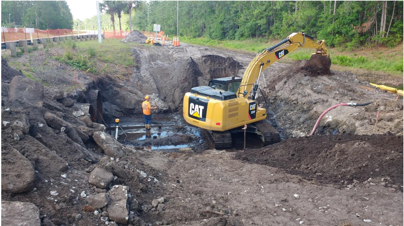
Pine Lakes Pedestrian Bridge-Site Preparation