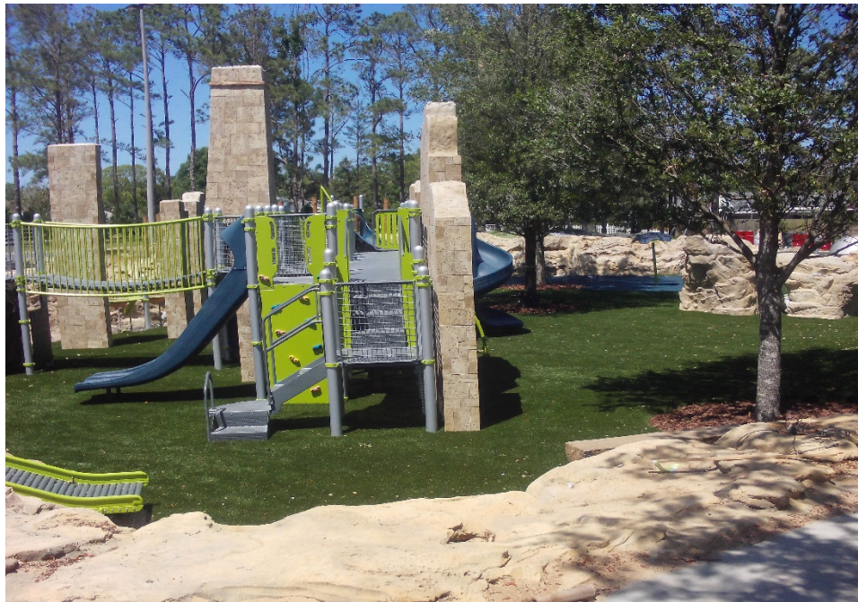
Holland Park – Playground