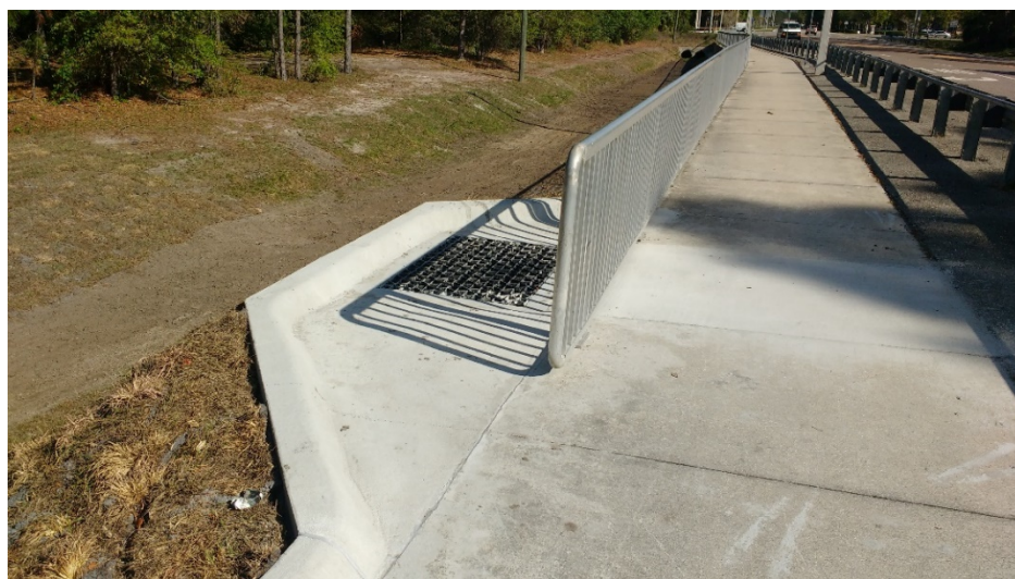
Pine Lakes Pedestrian Bridge