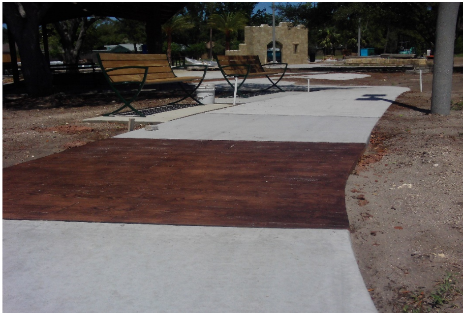
Holland Park – Faux Wood Sidewalk- Benches