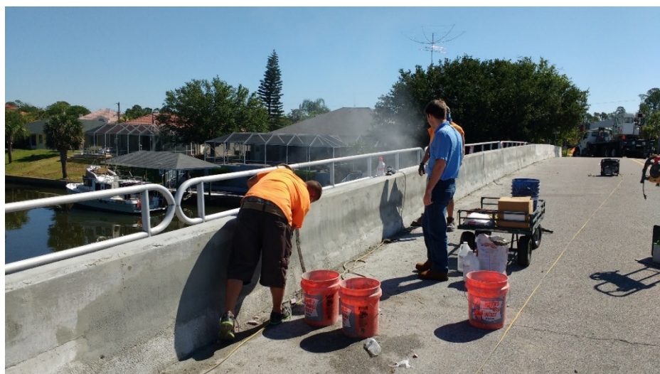
Colorado Drive Bridge Work