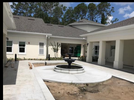
Watercrest Memory Care Facility