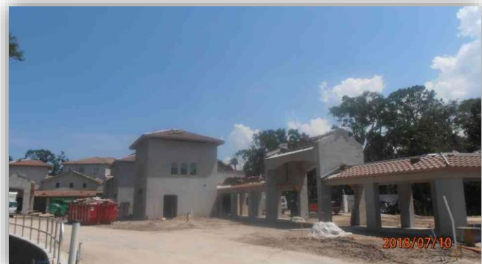
Tuscan Gardens Assisted Living Facility

This project is located at 650 Colbert Lane, Palm Coast. It consists of a 4 - story Assisted Living Facility with 86 Units and a 2 story Memory Care Building with 44 units. Included is an Amenity Building of approximately 15,757 square feet with a great room, dining area and a grand kitchen that will have a bistro style setting. Construction continues with completion expected late 2018 early 2019.