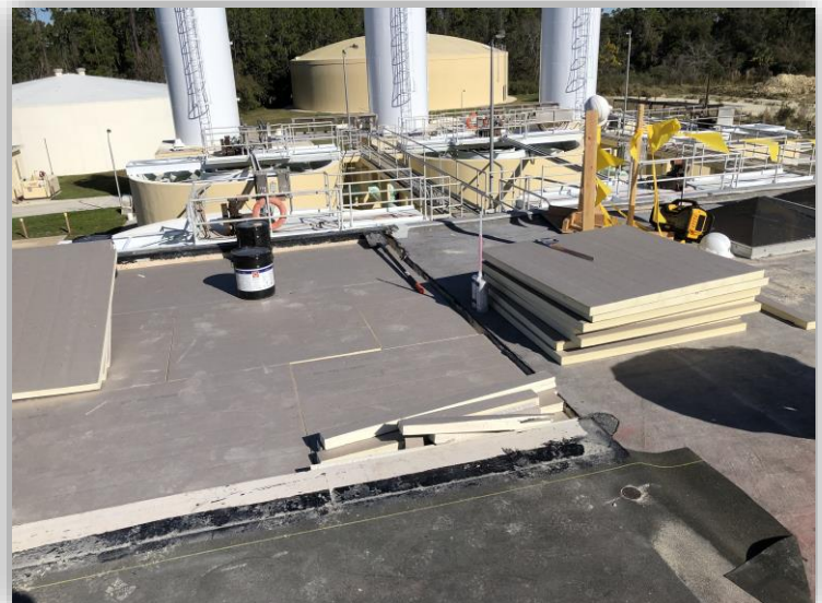
Water Treatment Plant #1 Roofing Work

City of Palm Coast Council approved the piggyback contract for the replacement of the roofs at the Main Filter/Office Building and Silo #2 at Water Treatment Plant #1 located at 4 Corporate Drive. The Main Filter/Office Building had a portion of its roof replaced last year. The contract covers the replacement of all remaining roof areas of the building and Silo #2