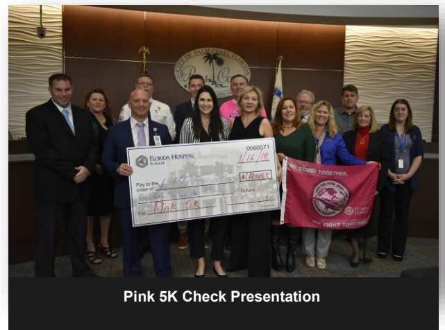
Pink 5K Check Presentation

This week, City Council presented Florida Hospital Flagler representatives, a check for $14,448, raised in last fall's Pink 5K. About 670 people participated in the run/walk event, one of the most successful ever. These funds were raised for the Florida Hospital Flagler's breast cancer fund, which provides screening mammograms, diagnostic studies and education to qualified local people. For more information, see the attached News Release.