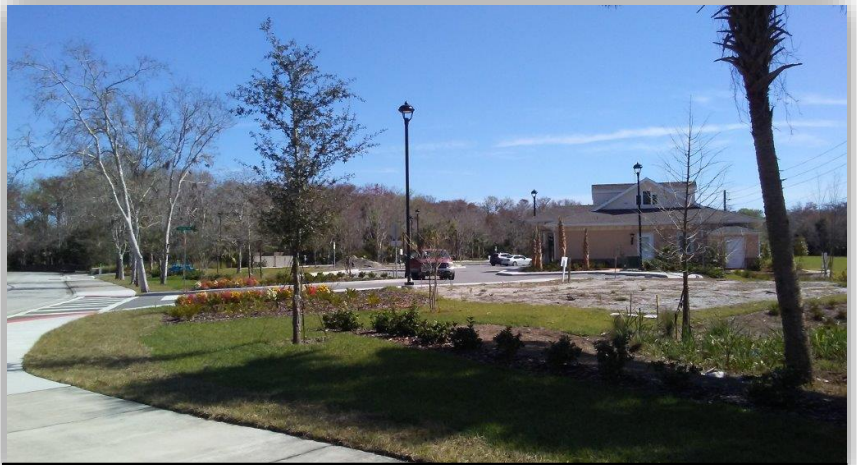
Creekside at Grand Haven

This is a 6 acre Commercial Subdivision located at the corner of Colbert Lane and Waterfront Park Drive, this site will have 5 commercial buildings with a total of 11 units for retail/office use.