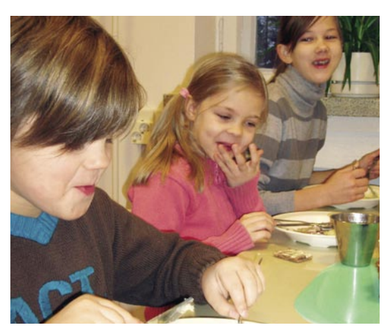
A good school meal is an investment in the future.