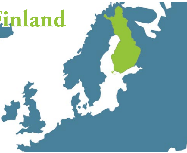
As a result of our geographical location in Northern Europe, our food culture has received strong influences from both the east and west.