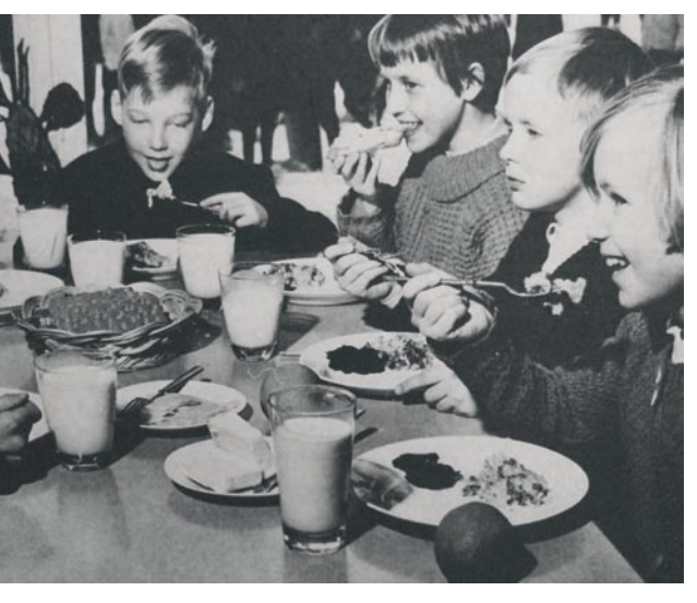
Free schoolmeals have long traditions in Finland.

Pre-primary and basic education are provided free of charge for all, and this includes school meals, teaching materials, school transport, and pupil welfare services.