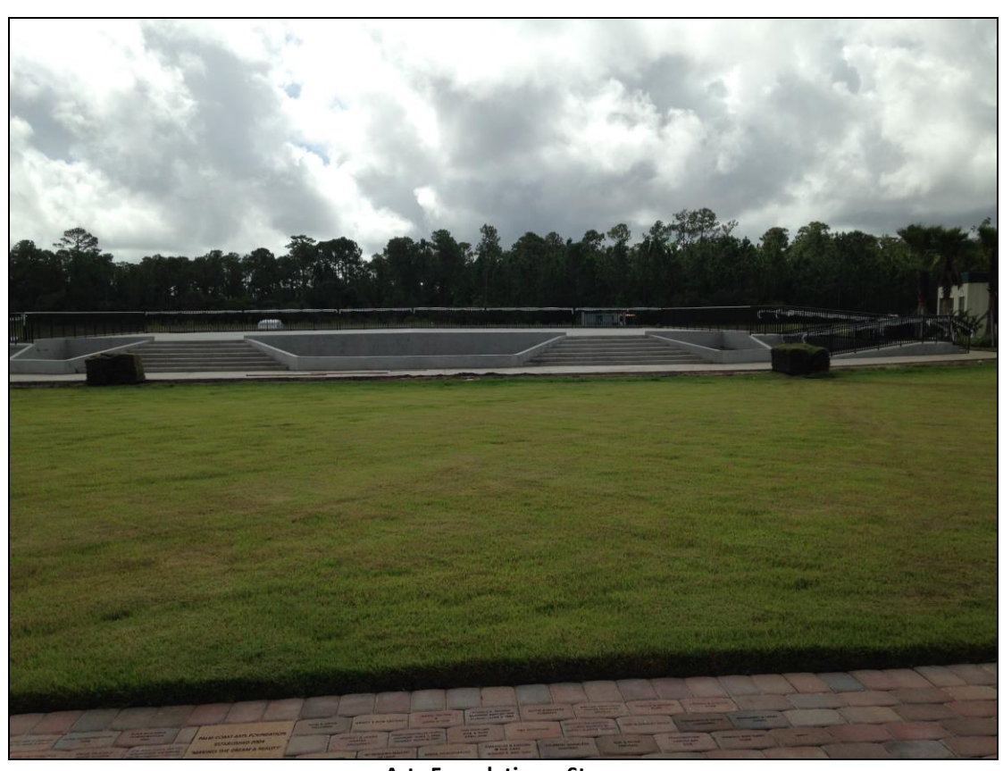
Arts Foundation – Stage