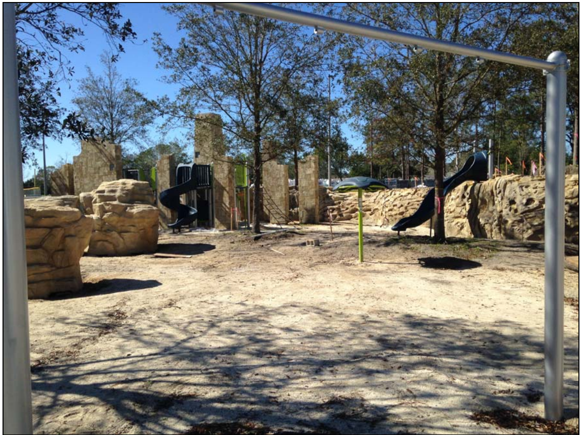
Holland Park - 2 of 3 Boulder Rocks