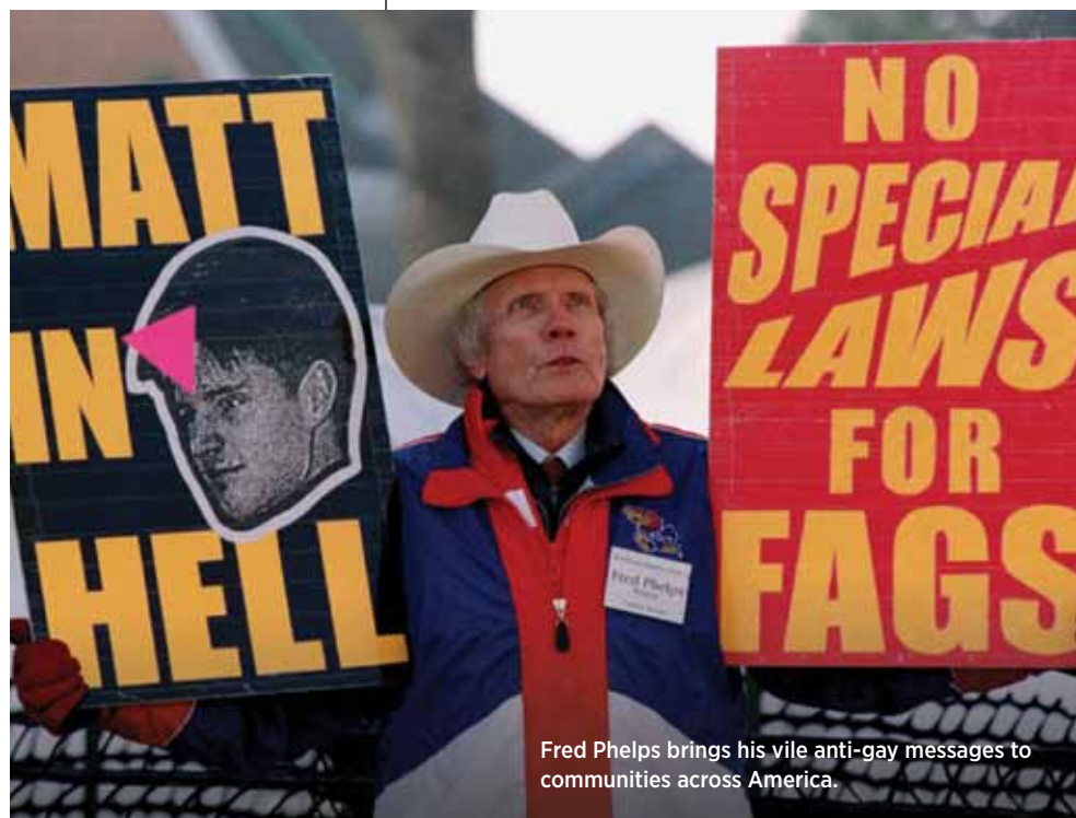
Fred Phelps brings his vile anti-gay messages to communities across America.

And yet, most hate crimes are not committed by members of hate groups. The SPLC estimates that fewer than 5 percent of hate crimes can be linked to members of hate groups. The majority appear to be the work of “freelance” perpetrators, typically young males who are looking for