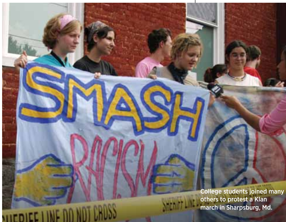
College students joined many others to protest a Klan march in Sharpsburg, Md.

> Educate reporters, editors and publishers about hate groups, their symbols and their effect on