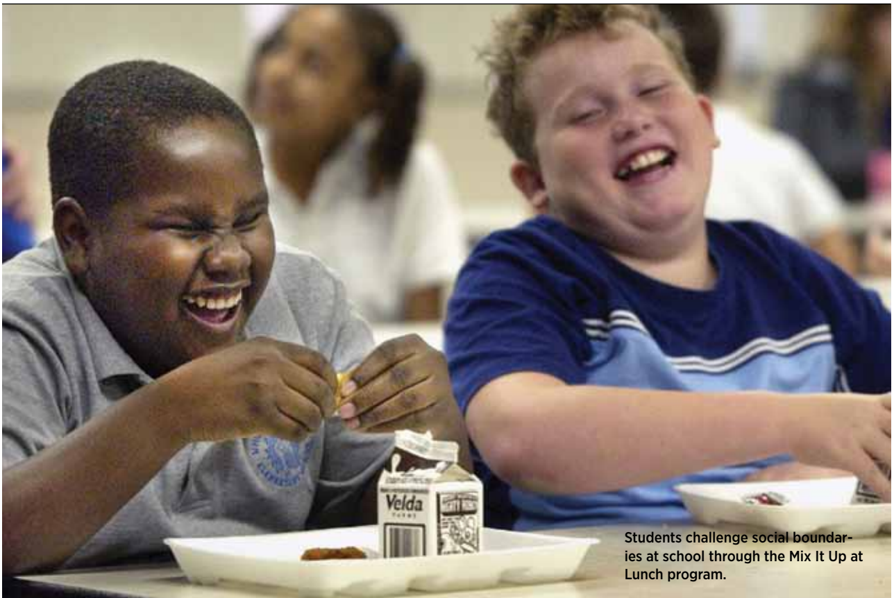
Students challenge social boundaries at school through the Mix It Up at Lunch program.

The Many and One Coalition, for example, formed in 2003 after a white supremacist group held a rally in Lewistown, Maine. (See story, page 12.)