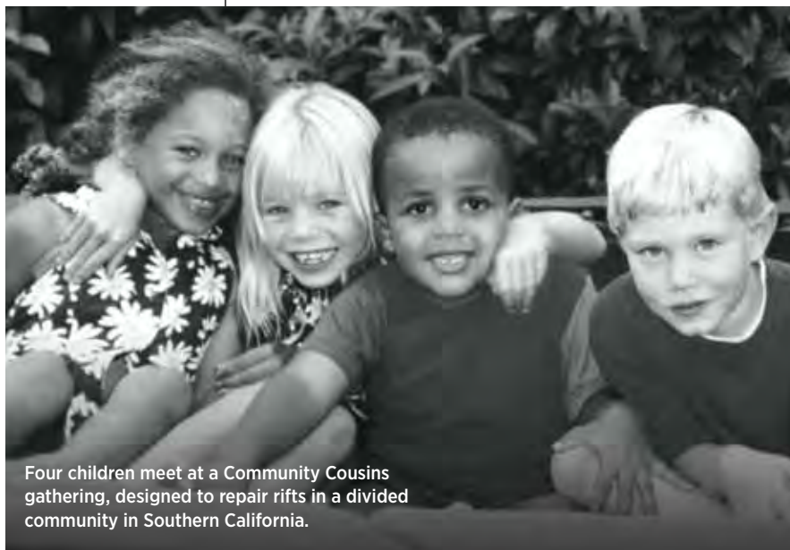
Four children meet at a Community Cousins gathering, designed to repair rifts in a divided community in Southern California.

➤ Fashion an appropriate, local response, but gather ideas from other towns that have faced hate events. A good starting point is a group viewing of the PBS video Not in our Town . It tells the story of an inspiring fight against white supremacists in Billings, Mont. (See story, page 9.)