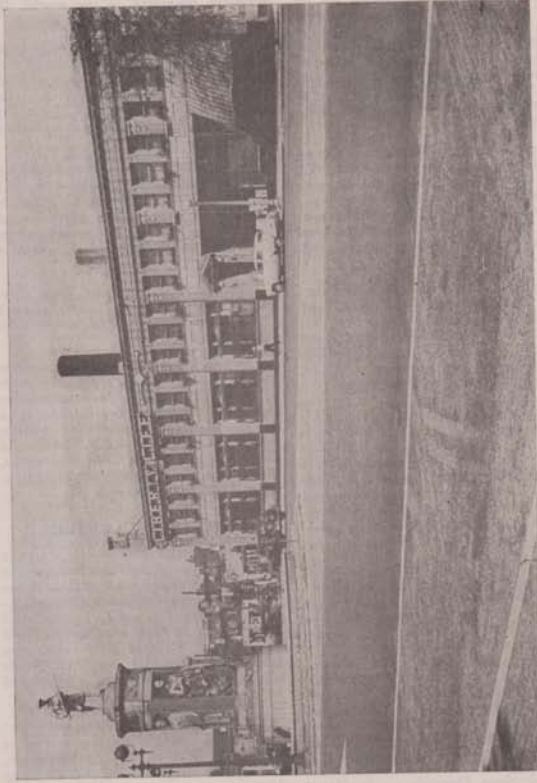
Victory, a statue erected at 35th and South Parkway by the people of the State of Illinois, in memory of the heroes of the "Old 8th" Infantry, Lincoln National Guard. In the background is the building of the Supreme Court. Liberty Life Insurance Company, third largest Negro insurance company in America. It employs 110 people in Chicago alone.