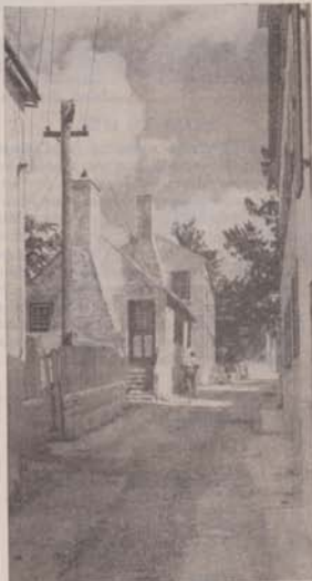
Queen Street, St. Georges, Bermuda

Mild and Equable never far off 70.7. No sudden changes occur. Rain-fall brief and skies clear very quickly after a shower.