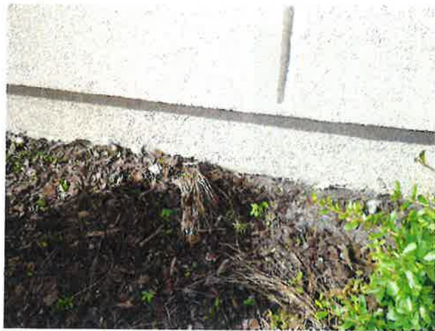
Figure 10. Exposed cement block near the base of exterior wall.