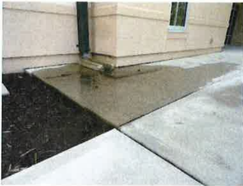
Figure 7. Water pooling in mulch and against building from downspout at front of building.