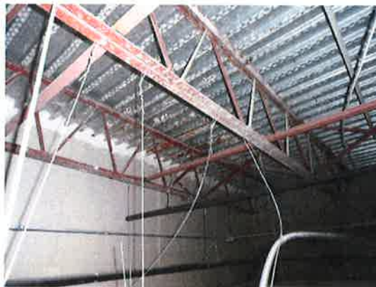
Figure 2. Rust on metal roof above the ceiling tiles in room 129.