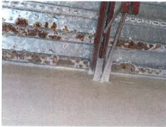
Figure 1. Rust on ceiling in the evidence room.