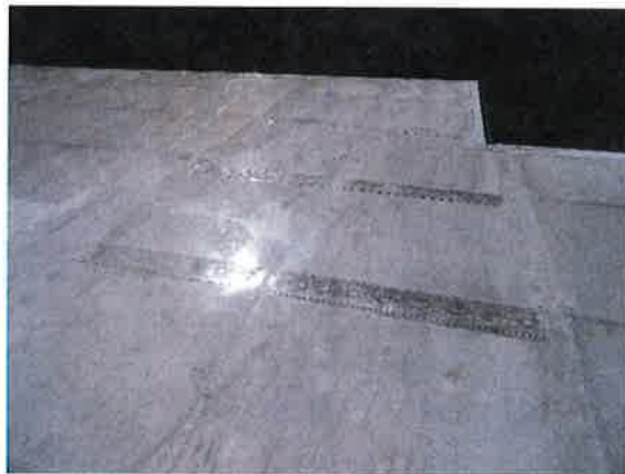
Figure 9. Patching on roof.