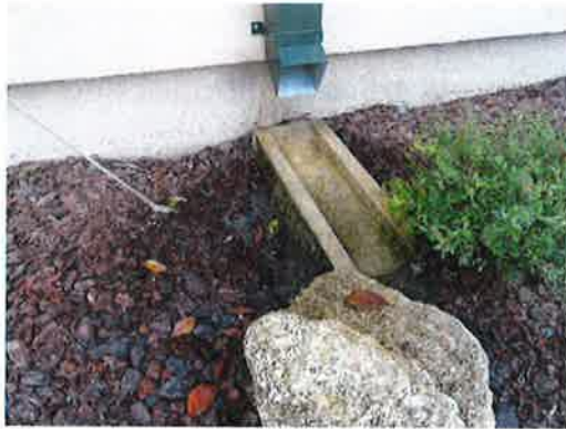
Figure 8. Water pooling in mulch and against building near outdoor patio space.