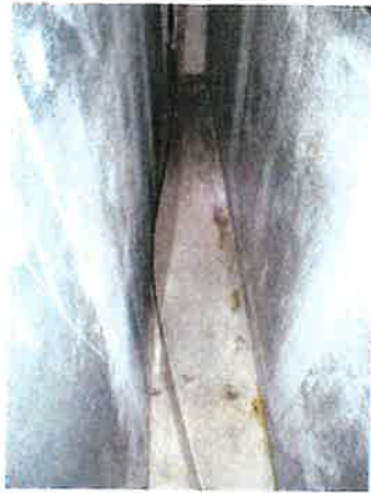
Figure 4. Visible water damage/stains between the walk-in freezer and refrigerator in the evidence area.