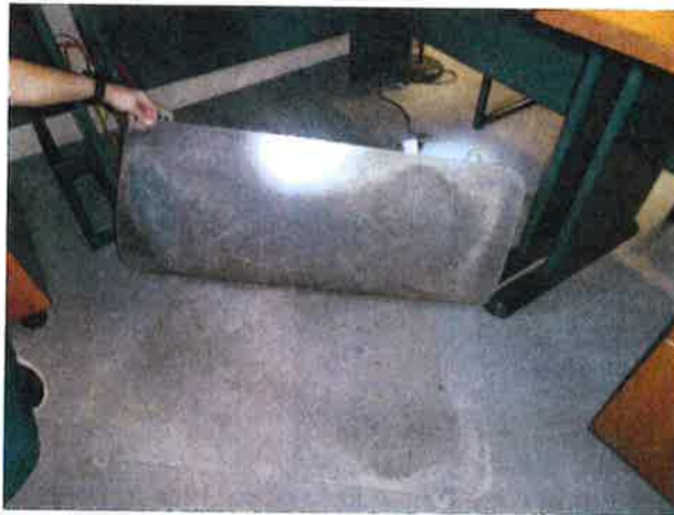
Figure 5. Visible stains and mold odor under plastic mat on concrete floor in the evidence room.