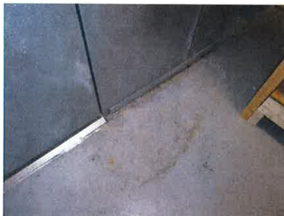
Figure 3. Visible water damage/stains in front of the walk-in refrigerator in evidence area.