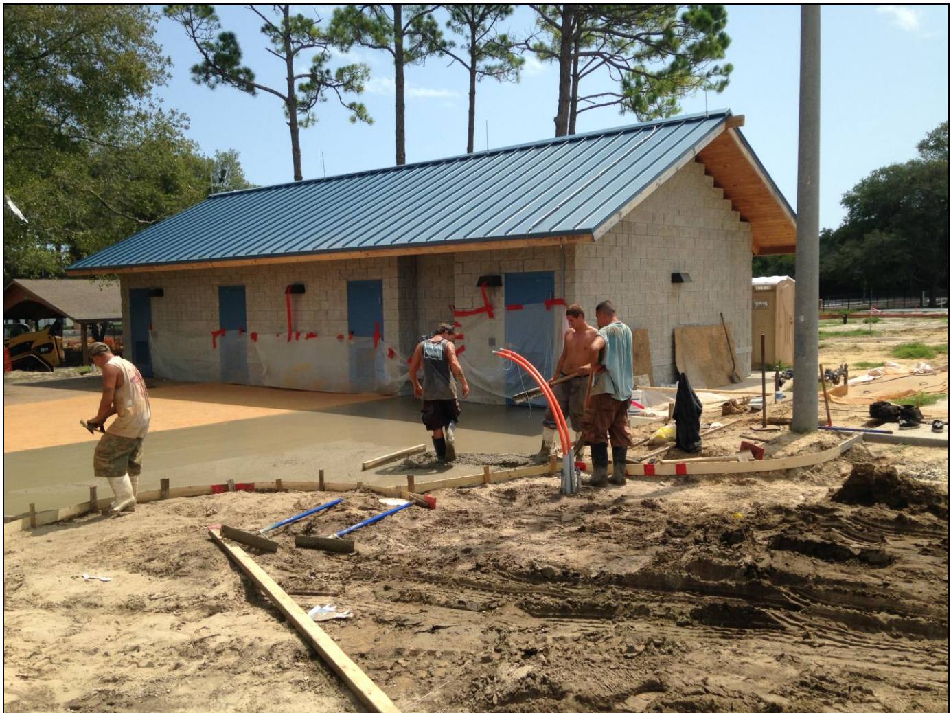
HOLLAND PARK - COLORED CONCRETE PAD