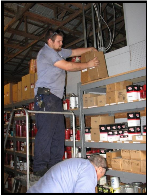
Organizing Parts Room