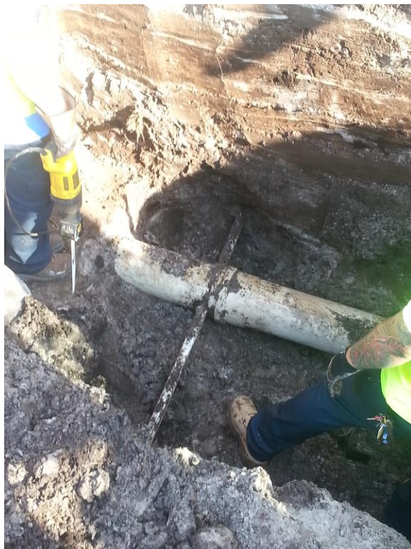
Sewer Main repair on Ferber Lane