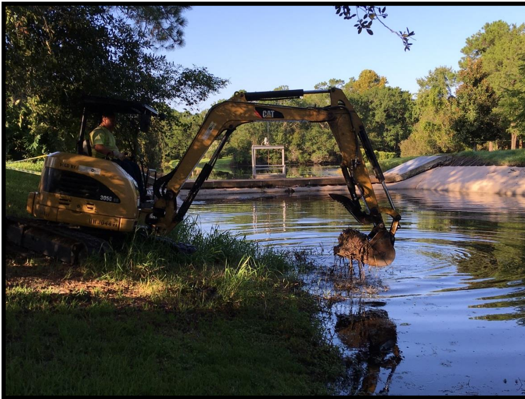
Silt Removal - BA-1 Water Control Structure

Activities for the Week of September 9, 2016