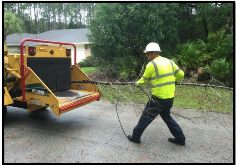
Storm Cleanup - Hurricane Hermine