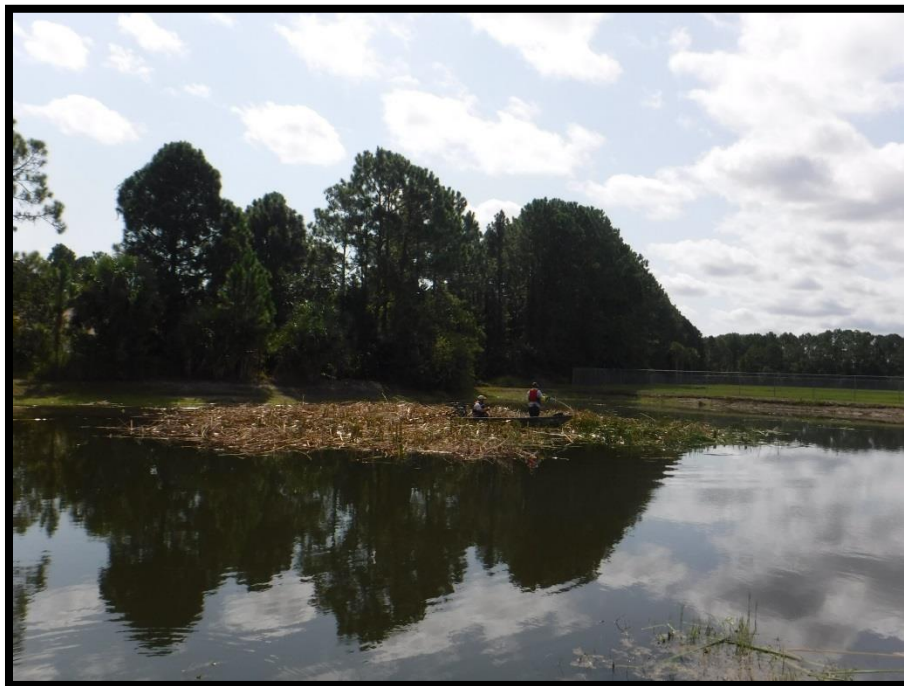
Herbicide Spraying Cattails - Belle Terre Park