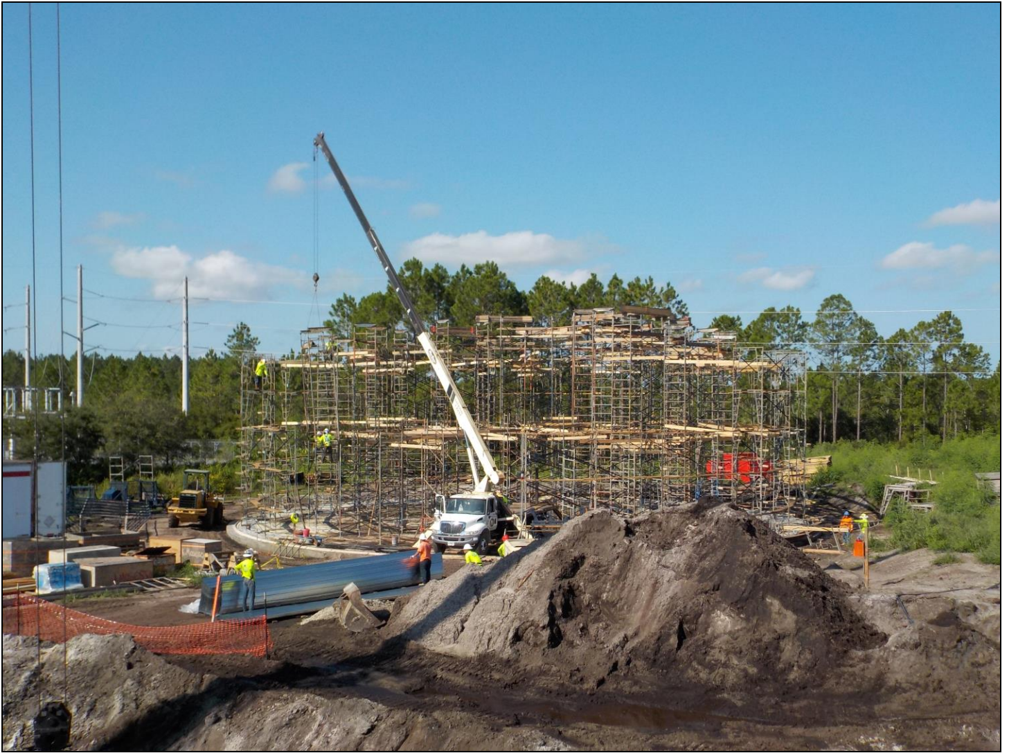
WASTE WATER PLANT 2 SCAFFOLD FOR GROUND STORAGE TANK