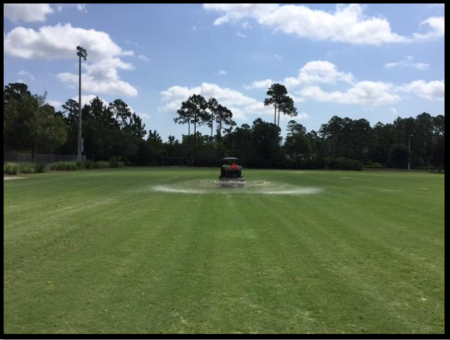
Top Dressing Sports Fields @ Indian Trails Sports Complex