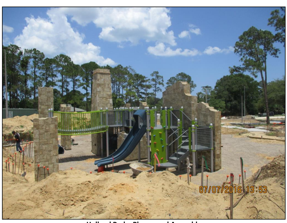
Holland Park - Playground Assembly