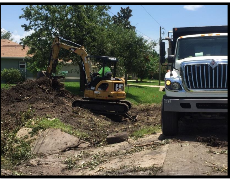
Ditch Improvements - Stormwater Modeling Project