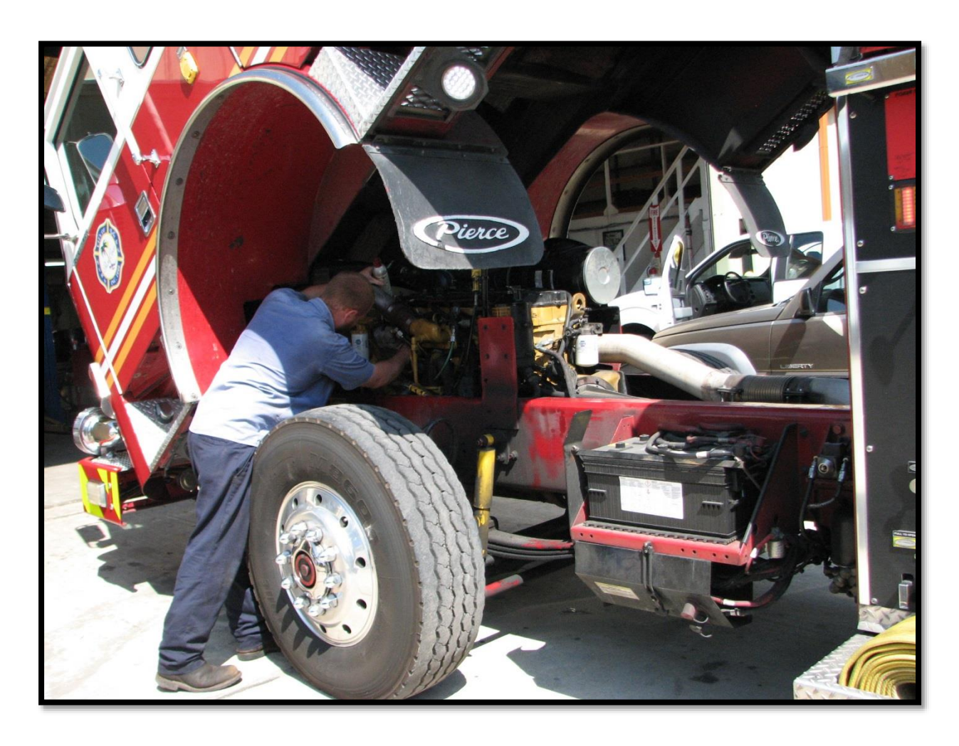
Fire Apparatus Repair