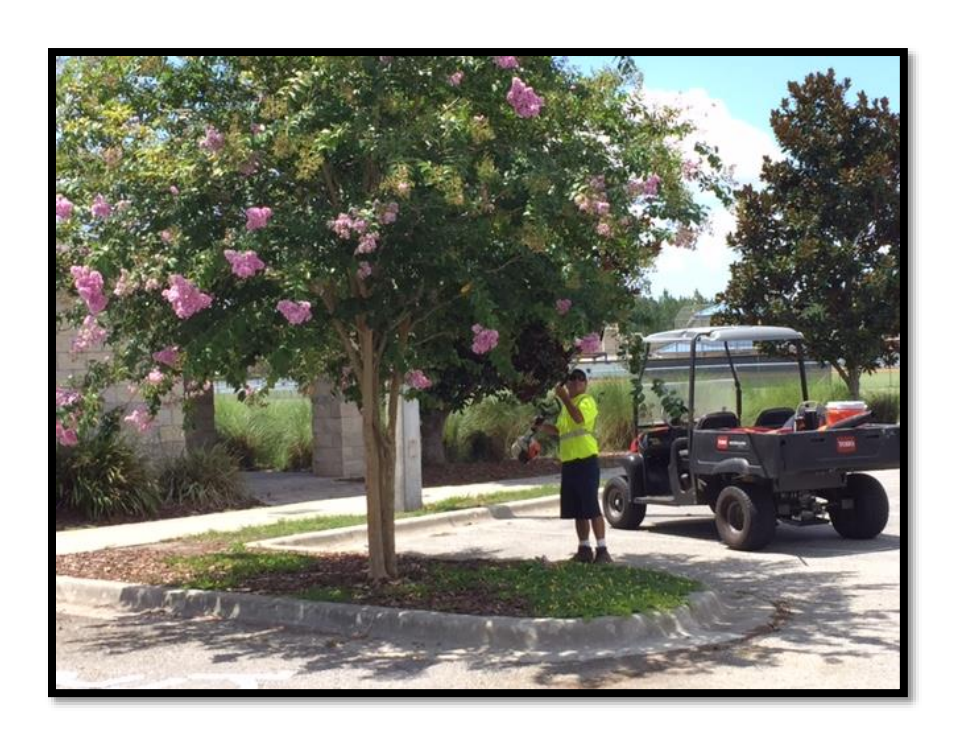
Trimming Crepe Myrtle @ Indian Trails Sports Complex