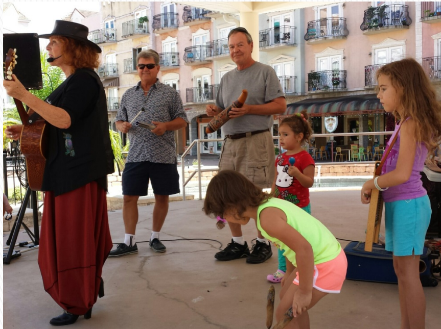
Arts and Education Week Aussie music at European Village