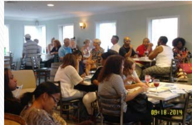
Poetry Slam The Winery at Flagler Beach