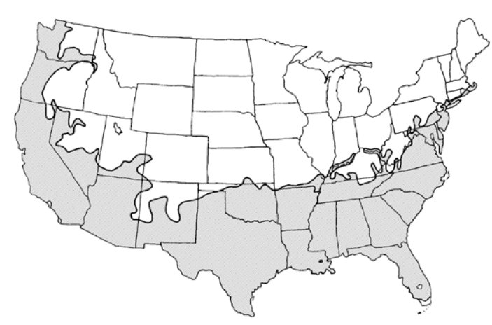
Figure 2. Range