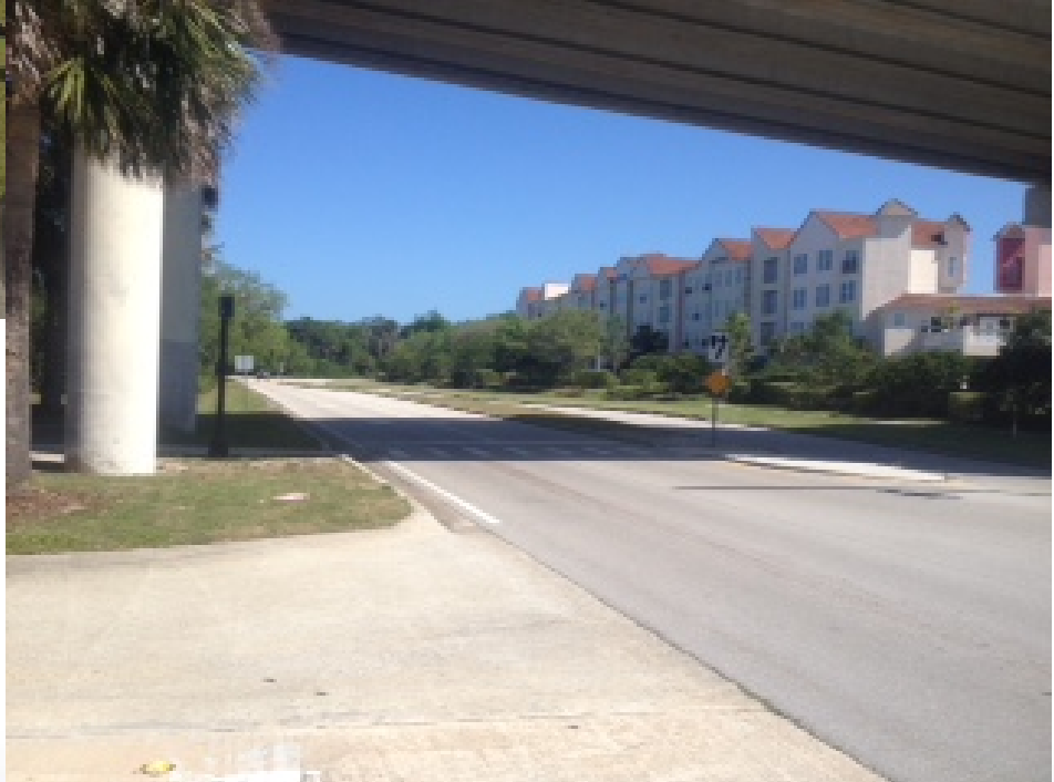
PALM HARBOR MEDIAN (LOOKING SOUTH)