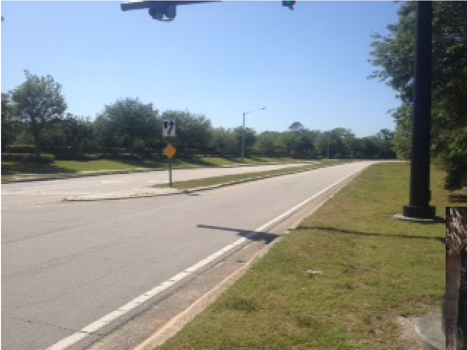
PALM HARBOR MEDIAN (LOOKING NORTH)