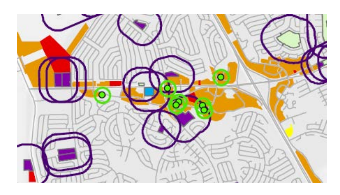
Along Palm Coast Parkway

1,000 ft. radius around church, school, or public park