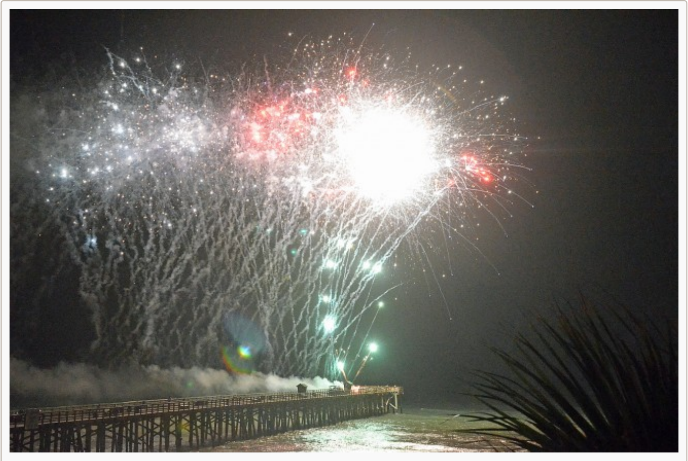
Flagler Beach\'s epic fireworks show has been a city favorite roughly since the Middle Ages. Click on the image for larger view.

Independence Day fireworks in Flagler Beach this year–2013– will be held on Thursday, July 4, at 9 p.m., off the Flagler Beach Pier, as always. Flagler Beach's Holiday Parade will begin at 10 a.m. The parade is sponsored by the Flagler Beach Rotary.