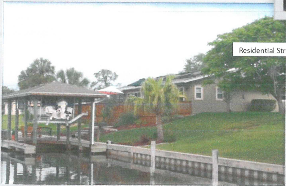
Residential Structural Beautification