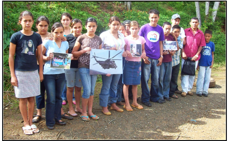
Many of the John Grove High School Students