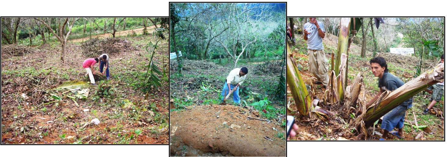
Clearing the Land!