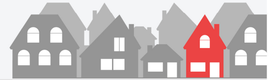
Flagler County Residential Permits