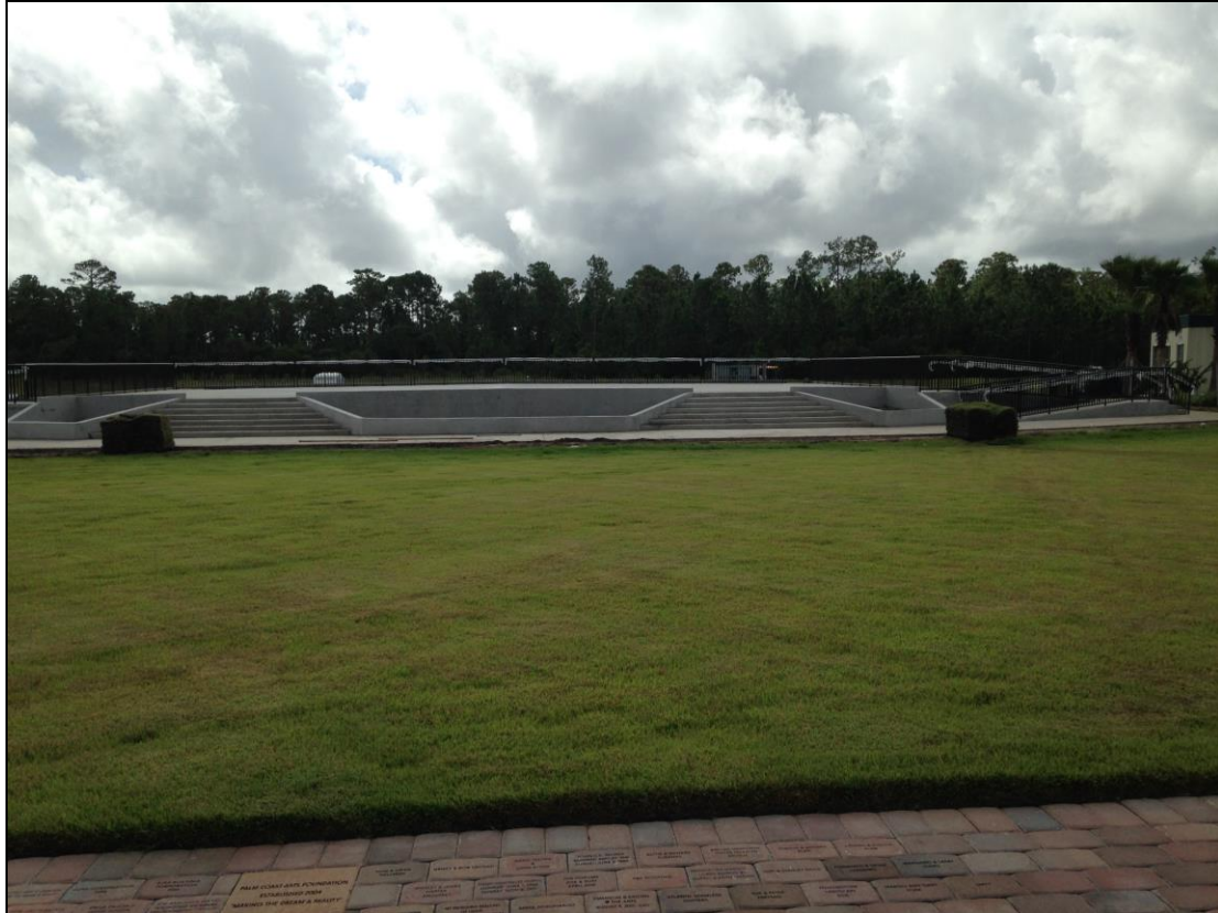
Arts Foundation – Stage