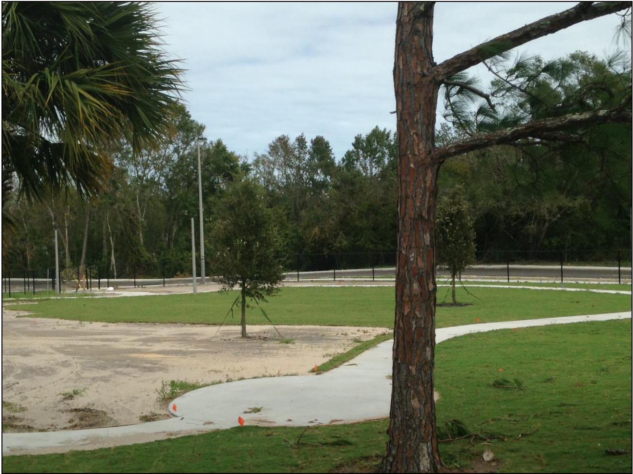
Holland Park - Dog Park Area