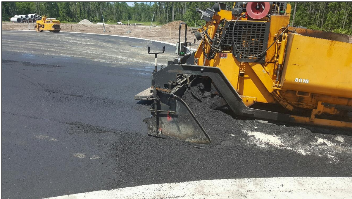
Paving Grand Landings