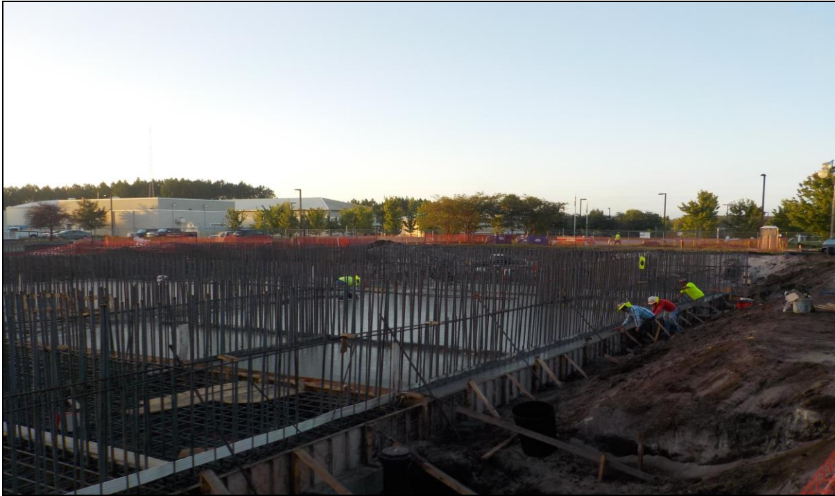
Waste Water Treatment Plant #2 Concrete Finishing Biological Process Tanks