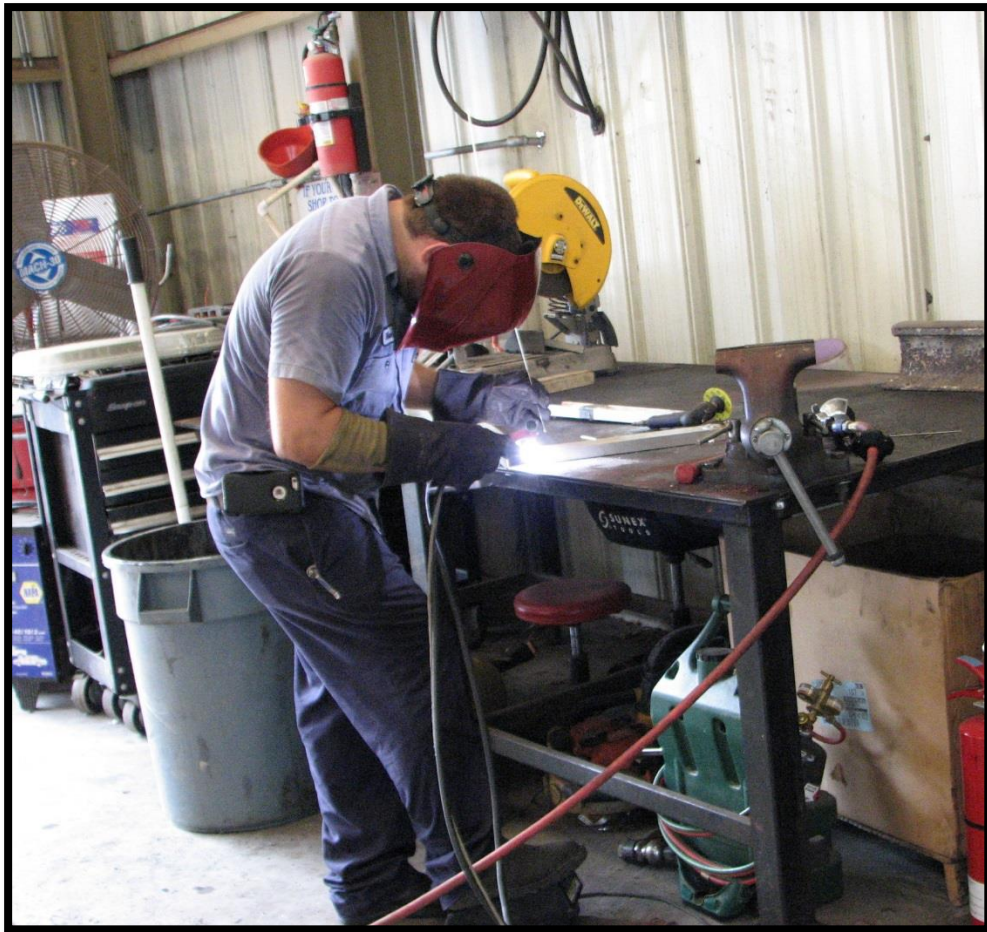
Welding Fleet Repair