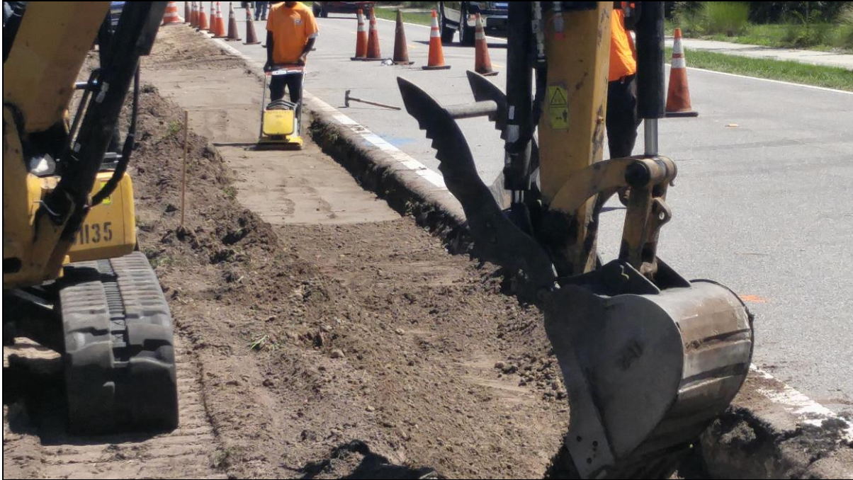
Airport Road Base @ Belle Terre Blvd.