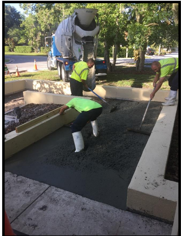
Sidewalk Installation @ Fire Station 22