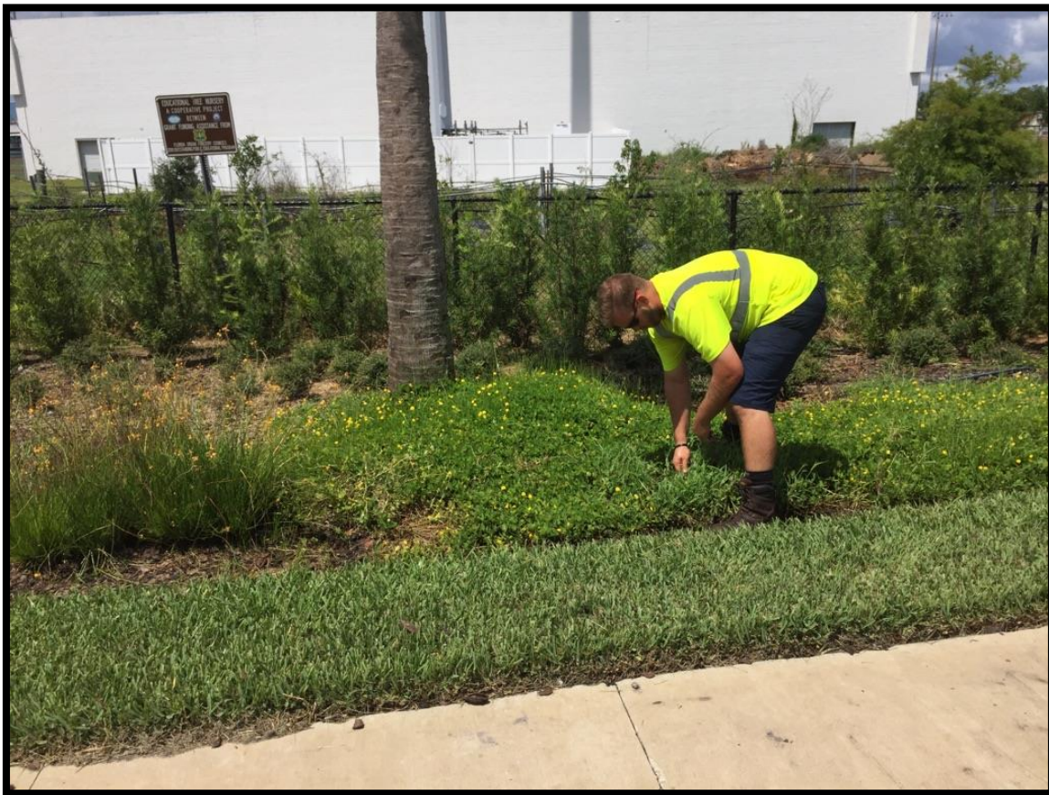
Weeding Parkway Medians

Activities for the Week of August 19, 2016